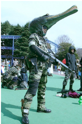
This will bring in a new sort of people to the marines too. Furries.

Another mandatory training course is the "Don't Trust Anything in the Water" curriculum. There, marines are trained to be skeptical of every single thing they see under the water. Is that a rock? Nope! It's a stonefish, the most venomous fish in the world! Is that a pretty purple anemone? Wrong again! It's a blue ring octopus that can paralyze you! "That one is really stressful," Obama mused. "We basically have them look at two identical pictures and guess which one will kill them. Often, it's a trick question, and both will result in some kind